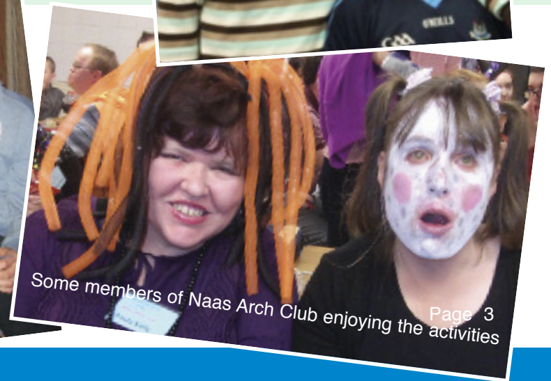
Some members of Naas Arch Club enjoying the activities