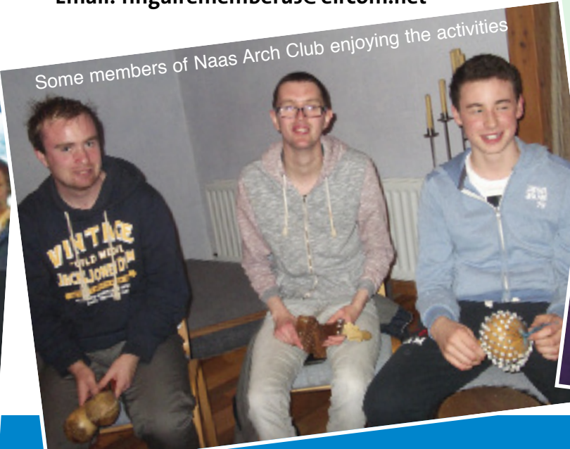
Some members of Naas Arch Club enjoying the activities