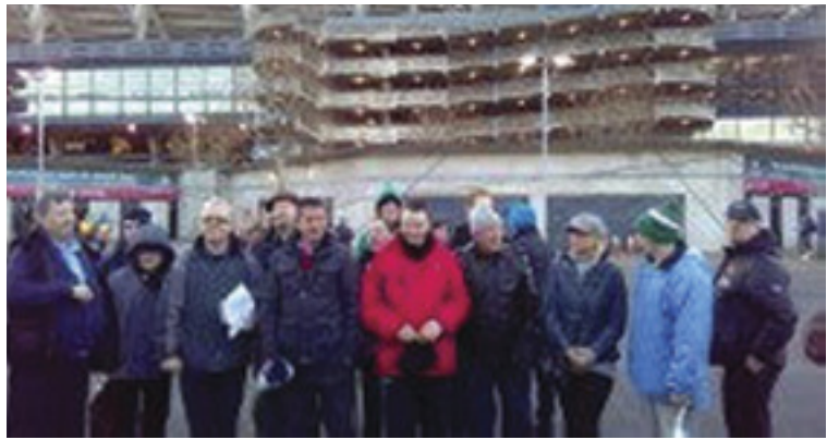
Caption for this photo???

Ronanstown Arch Club Dublin would love to meet up with other groups around the country – maybe exchange visits or plan an event together. If interested contact Caroline Lawless 086 1304596