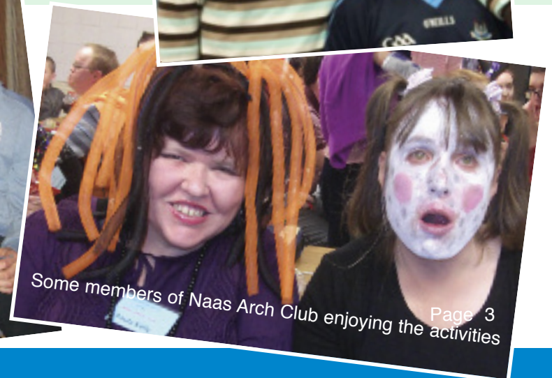
Some members of Naas Arch Club enjoying the activities